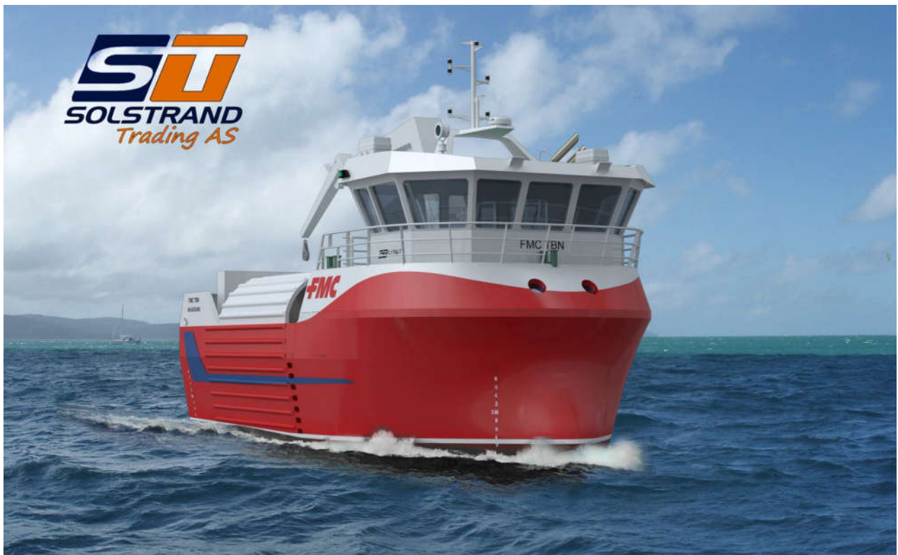
Illustration: Solstrand Trading AS

Built for: FMC Biopolymer AS Haugesund, Norway